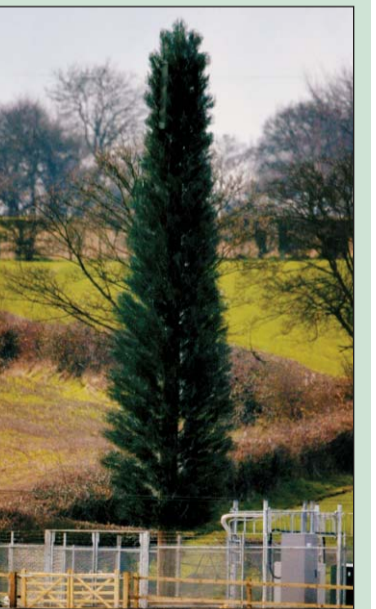
■ HIDDEN: A phone mast disguised as a pine tree in Berkhamstead.

Antennas are mounted at the centre of each of the four faces of the clock next to the hands. In effect mobile phones masts come in several sizes. The most common are the ones we usually see — macrocell masts which tower over the neighbourhood. But there are others often hard to spot which can be sited in any main street and look more like a